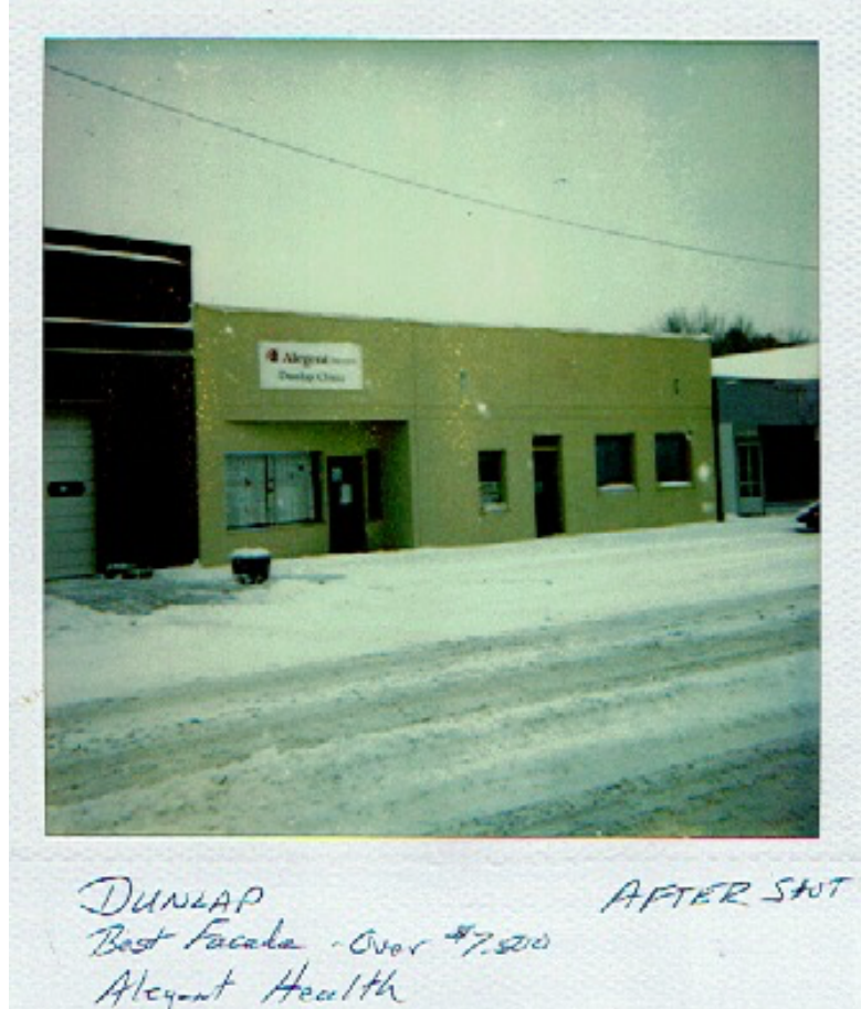
DUNLAP Best Facala - Over $7,500 Aleyant Health