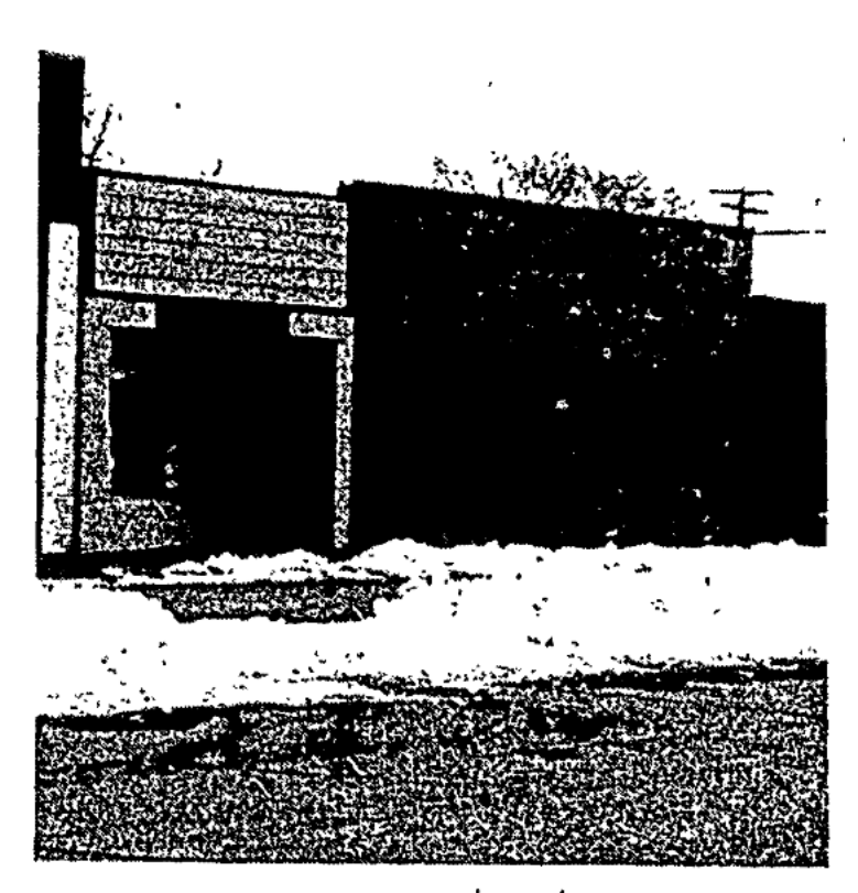
Dunlap Medical Center changed hands this week with Community Memorial Hospital buying the facility and making plans to staff it in the near future.

Members of the Dunlap Emergency Unit Squads re-